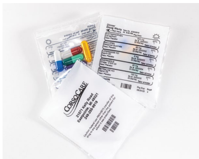
CorsoCare Packets (parata pouches)

Please select your preferred medication packaging: